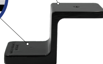
Fusion Conduit Mount in Black Powder Coated Color / Finish.