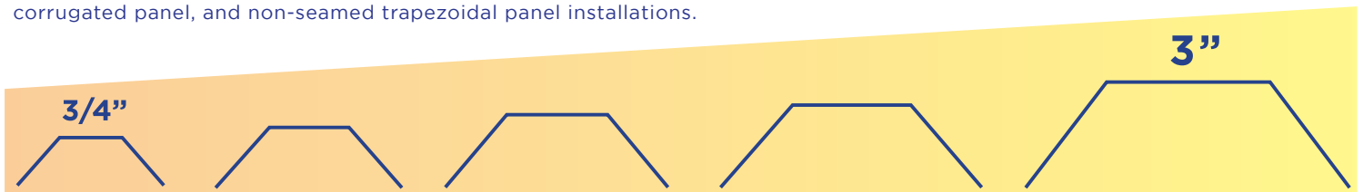
(Panel Corrugations Are Not To Scale)

PowerMount Adjust features the unique and exceptional capability of adjusting to any corrugation angle or width from 3/4" wide all the way up to 3" wide, eliminating the need to inventory multiple products or carry multiple SKUs for your R-Panel, corrugated panel, and non-seamed trapezoidal panel installations.