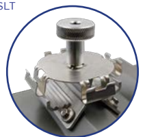
SOLAR CONNECTIONS KIT