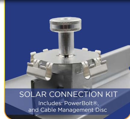
SOLAR CONNECTION KIT

Includes: PowerBolt®, and Cable Management Disc