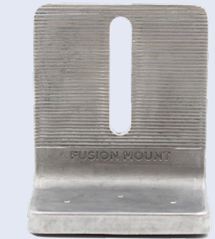
Fusion Mount In Standard Mill Finish Aluminum