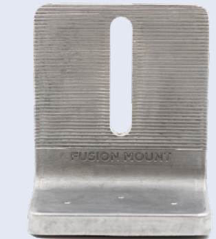
Fusion Mount In Standard Mill Finish Aluminum