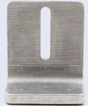
Fusion Mount In Standard Mill Finish Aluminum