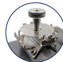
SOLAR CONNECTIONS KIT